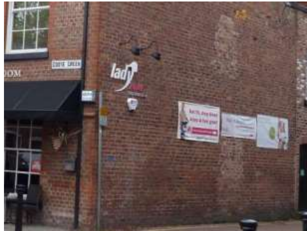
Inappropriate commercial signage