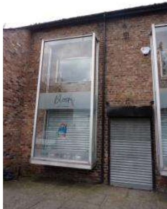
Inappropriate box windows, No. 7 Goose Green