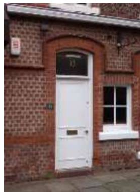
Thick, unattractive pointing at No. 13 Goose Green, where there is also evidence of spalling brickwork which is detracting from the otherwise attractive brickwork.