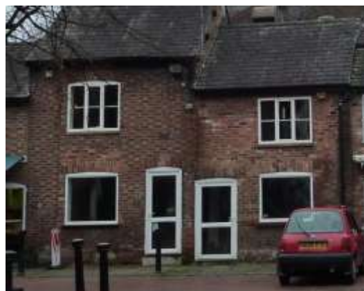
Inappropriate replacement doors and ground floor windows, Nos. 5-6 Goose Green