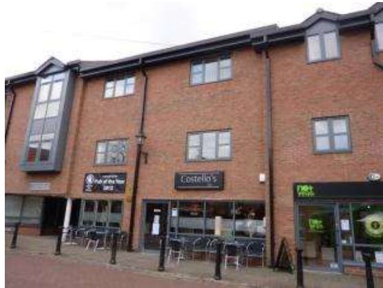
Modern development on the south side of Goose Green