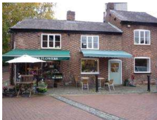
Shop awnings, No. 3 Goose Green