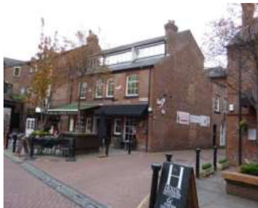
Inappropriate roof extension, Nos. 9 and 10 Goose Green