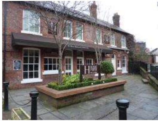
Nos. 11-13 Goose Green, which have lost their original architectural balance due to the addition of extra windows at ground floor level.