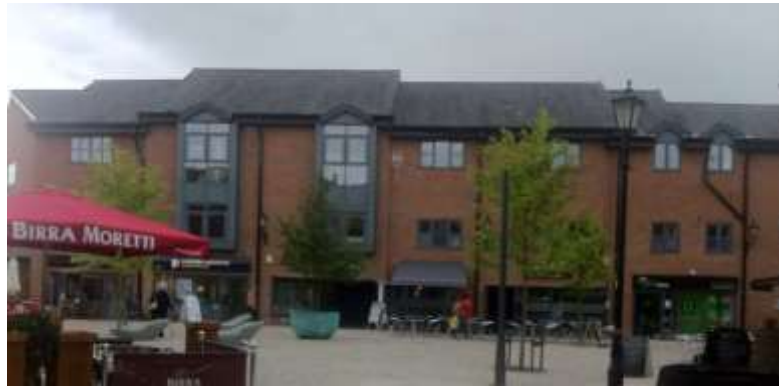
Modern shop fronts on the south side of Goose Green